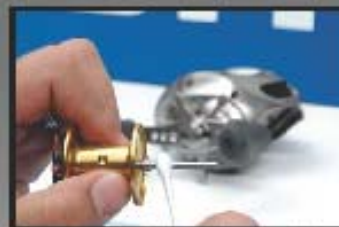
Inspect and clean spool assembly. Clean spool shaft and oil spool bearing or bushing if applicable. Note: Do not grease spool shaft, as it will affect freespool adversely.