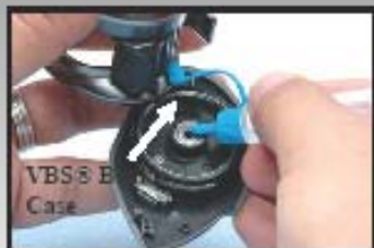
Clean and oil VBS® Brake Case and spool bearing. A clean and oiled brake case will ensure quiet casting performance.