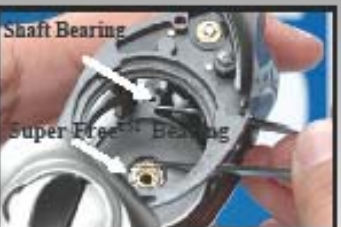
Lightly oil Super Free™ support bearing and drive shaft bearing.