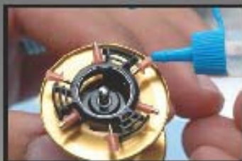
Clean and oil VBS® Brake Collars to maintain quiet, efficient casting performance. Replaced Brake Collars if worn or excessively dirty.