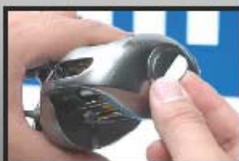
For most reels, access spool assembly via Turnkey Dial. Spool access on Chonarch® reels is via Escape Hatch™ - located on the rear lower left hand side of reel.