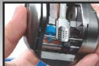
Clean and oil levelwind system. Grease may also be used for high usage reels to further prevent wear and tear or corrosion.