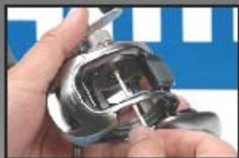
Clean the inside of pinion gear with a cotton swab for optimal freespool and casting performance.