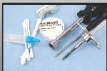
Tools and cleaning materials recommended to service reel. Some Shimano® reels come with Bantam™ Oil. These simple tools are readily available at hardware stores.

http://fish.shimano.com/publish/content/fish/sac/us/en/customer_service/reel_schematics.html