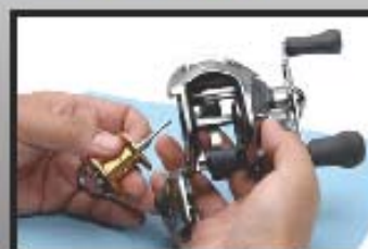
Remove spool assembly. Clean any visible dirt and debris from exterior of reel with cotton swabs or toothbrush and isopropyl rubbing alcohol. Dirt, debris, salt or sand leads to wear and tear.